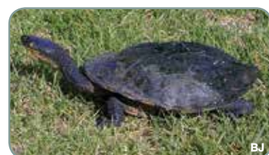
Long-necked Tortoise Chelodina longicollis Permanent waterholes; in Summer males range widely over dry land seeking new habitat, leading to frequent road-kill.