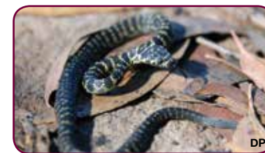
Broad-headed Snake Hoplocephalus bungaroides Endangered (NSW), possibly regionally extinct due to continuing bush rock theft.