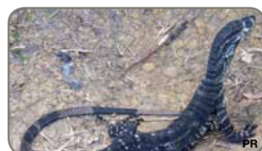
Lace Monitor Varanus varius Wide-ranging species now uncommon and in decline due to habitat loss and connectivity. Rosenberg's Monitor Varanus rosenbergi - Vulnerable (NSW). Similar to Lace Monitor, however both front and hind legs dotted (no stripes). Very uncommon. Not illustrated.