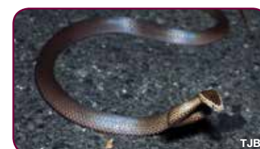
Golden-crowned Snake Cacophis squamulosus Common although rarely seen - nocturnal.