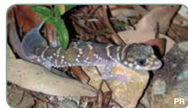
Thick-tailed Gecko Underwoodisaurus milii An uncommon species of larger, intact remnants.