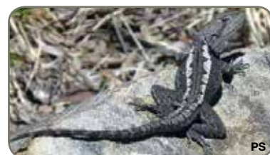
Jacky Lizard Amphibolurus muricatus Common in larger remnants. The similar Mountain Dragon ( Rankinia diemensis ) not illustrated.