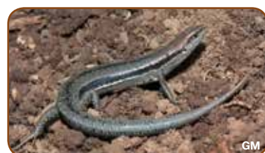
Pale-flecked Garden Skink Lampropholis guichenoti Common and widespread.