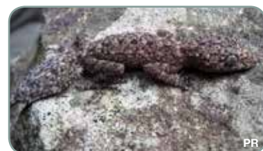
Broad-tailed Gecko Phyllurus platurus An uncommon species of larger, intact remnants.