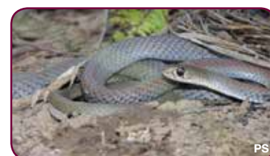
Whip Snake Demansia psammophis Common and widespread.