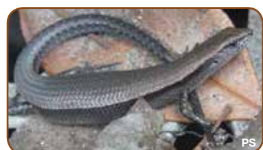
Dark-flecked Garden Skink Lampropholis delicata Common and widespread.