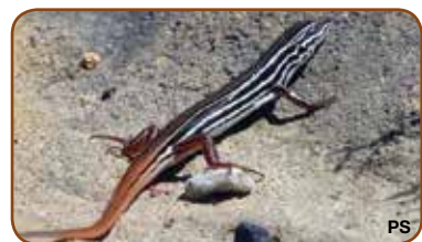
Copper-tailed Ctenotus Ctenotus taeniolatus Common and widespread.