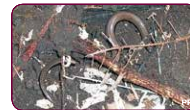
Three-toed Skink Saiphos equalis Uncommon but can survive in smaller remnants; burrows in leaf litter and under embedded woody materials in moist soils.