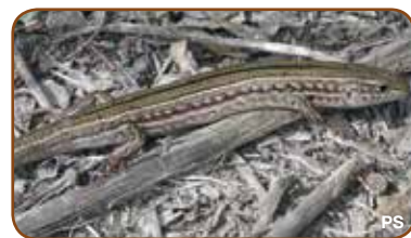
Robust Ctenotus Ctenotus robustus A large species of skink, common.