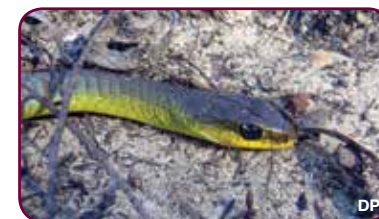
Common Tree Snake Dendrelaphis punctulatus Common although rarely seen.