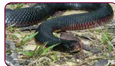
Red-bellied Black Snake Pseudechis porphyriacus Common, especially riverside and swamp habitats.