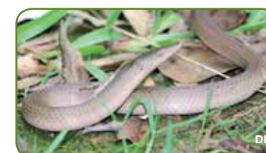
Burtons Legless Lizard Lialis burtonis An uncommon species.