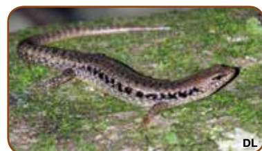
Bar-sided Skink Eulamprus tenuis Common in Casuarina forests (often called 'She-oak skink') and other habitats throughout region.