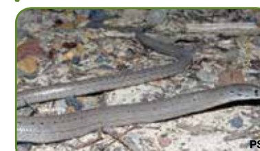
Scaly-foot Pygopus lepidopodus A common species of larger remnants.