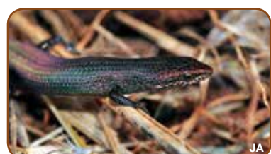
Tree-base Litter-Skink Lygisaurus foliorum Uncommon and widespread.