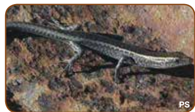
Cream Striped Shinning Skink Cryptoblepharus virgatus Common & widespread.