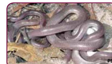
Blind Snake Ramphotyphlops nigrescens A rarely seen inhabitant of good quality remnants, where it burrows in leaf litter.