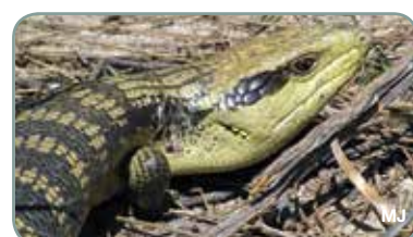
Eastern Blue-tongue Tiliqua scincoides Wide-ranging common species of urban fringe.