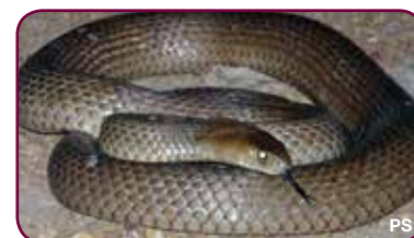
Eastern Brown Snake Pseudonaja textilis Common in larger remnants.