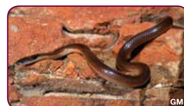
Red-naped Snake Furina diadema Reasonably common and widespread but rarely observed - generally nocturnal.