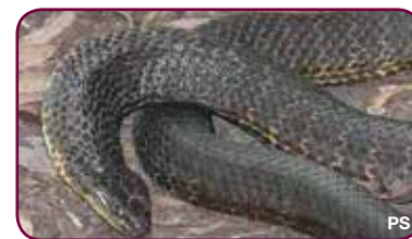
Tiger Snake Notechis scutatus Once common in swamps throughout the region this species is now uncommon.