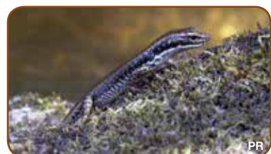
Eastern Water-Skink Eulamprus quoyii Common beside water throughout region.