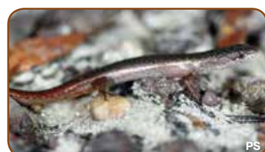
Weasel Skink Saproscincus mustelinus Uncommon but can survive in smaller remnants.