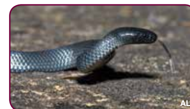
Eastern Small-eyed Snake Cryptophis nigrescens Common although rarely seen - nocturnal.