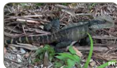
Eastern Water Dragon Physignathus lesueurii Common in larger remnants.