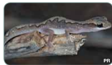
Wood Gecko Diplodactylus vittatus An uncommon species of larger, intact remnants.