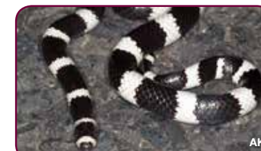
Bandy-Bandy Vermicella annulata Uncommon and declining, this striking nocturnal species burrows in the leaf litter, where it preys on Blind Snakes.