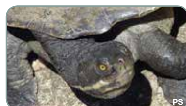
Nepean Short-necked Tortoise Emydura macquarii dharuk Hawkesbury-Nepean River and large wetlands. Pure form restricted to upper Nepean and Colo rivers; elsewhere interbred with exotic stock from pet trade.