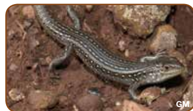
White's Skink Egernia whitii Uncommon but widespread. The similar Cunningham's Skink ( Egernia cunninghami ) not illustrated.