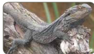
Bearded Dragon Pogona barbata Common in larger remnants.